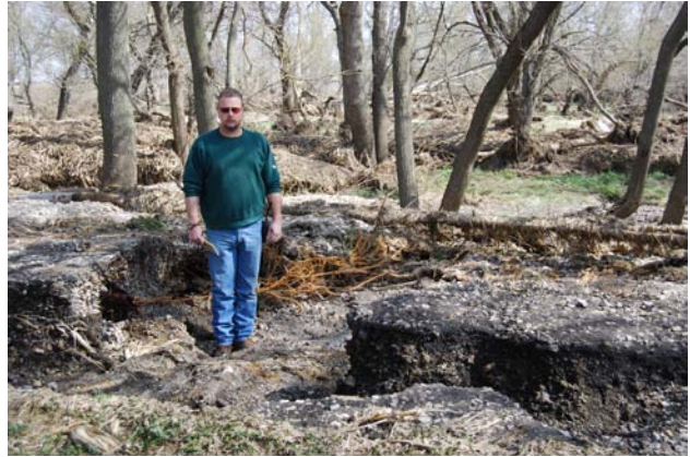
Some of the damage to the Wolf Creek Nature Trail during 2008.

During late FY '08 significant damage was wrought on the trail by excessive flooding of Wolf Creek. After working with FEMA officials during most of FY '09 it is anticipated the trail will be renovated during early FY '10.